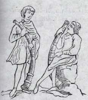
Fig. 165.—Shepherd's Horn. Eighth Century. (MS., British Museum.)

blowing a similarly banded horn: monasteries in Medieval England owned vast tracts of the countryside, and working with sheep provided a substantial part of monastic income. 4 Other evidence is found in the English nursery rhyme that begins: "Little Boy Blue, come blow up your horn: the sheep's in the meadow, the cow's in the corn ..." The earliest known